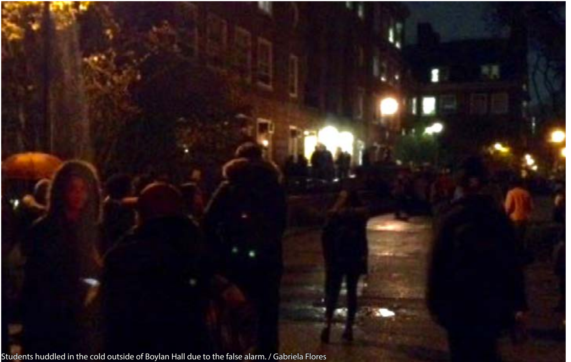
Students huddled in the cold outside of Boylan Hall due to the false alarm.