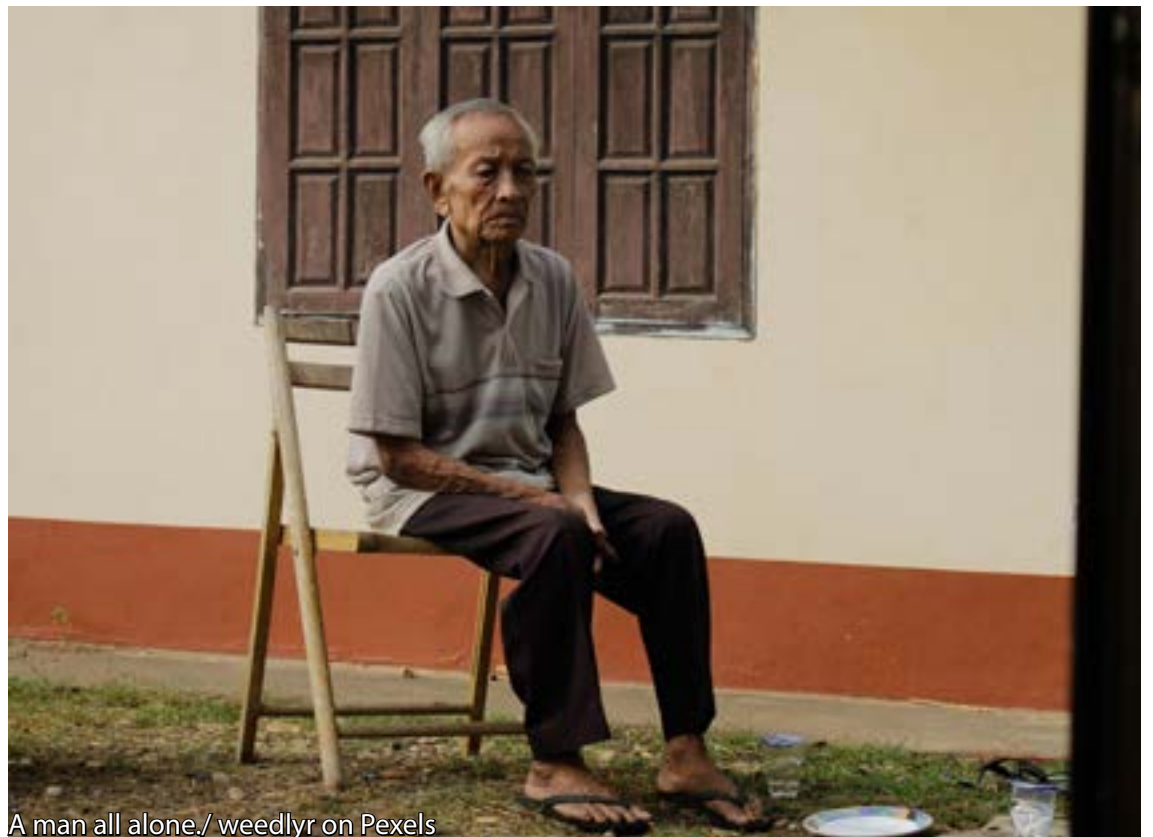
A man all alone.

Regardless of what this discomfort might point to, my guess is that the totality of it leads to one thing: an overall discomfort with solitude. It made sense to me when I thought about it. Many associate solitude with loneliness and the stigma behind it is almost always negative. Solitude in the public’s eye might define you as a person who’s unapproachable, undesirable, or uninteresting, because opposite traits don’t repel — they attract.