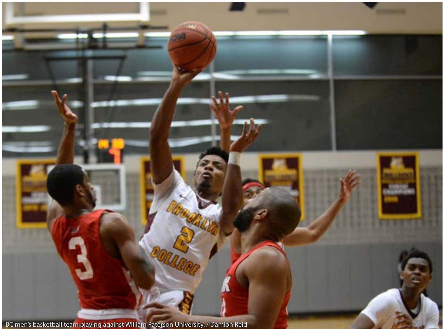
BC men's basketball team playing against William Paterson University.

After the slow start, the defense of the Bulldogs became energetic and tenacious. Players cut into passing lanes, rotated strongly for defensive help, and were strong in the paint to stop William Paterson from getting easy buckets. The early timeout that woke up the team seemed to work