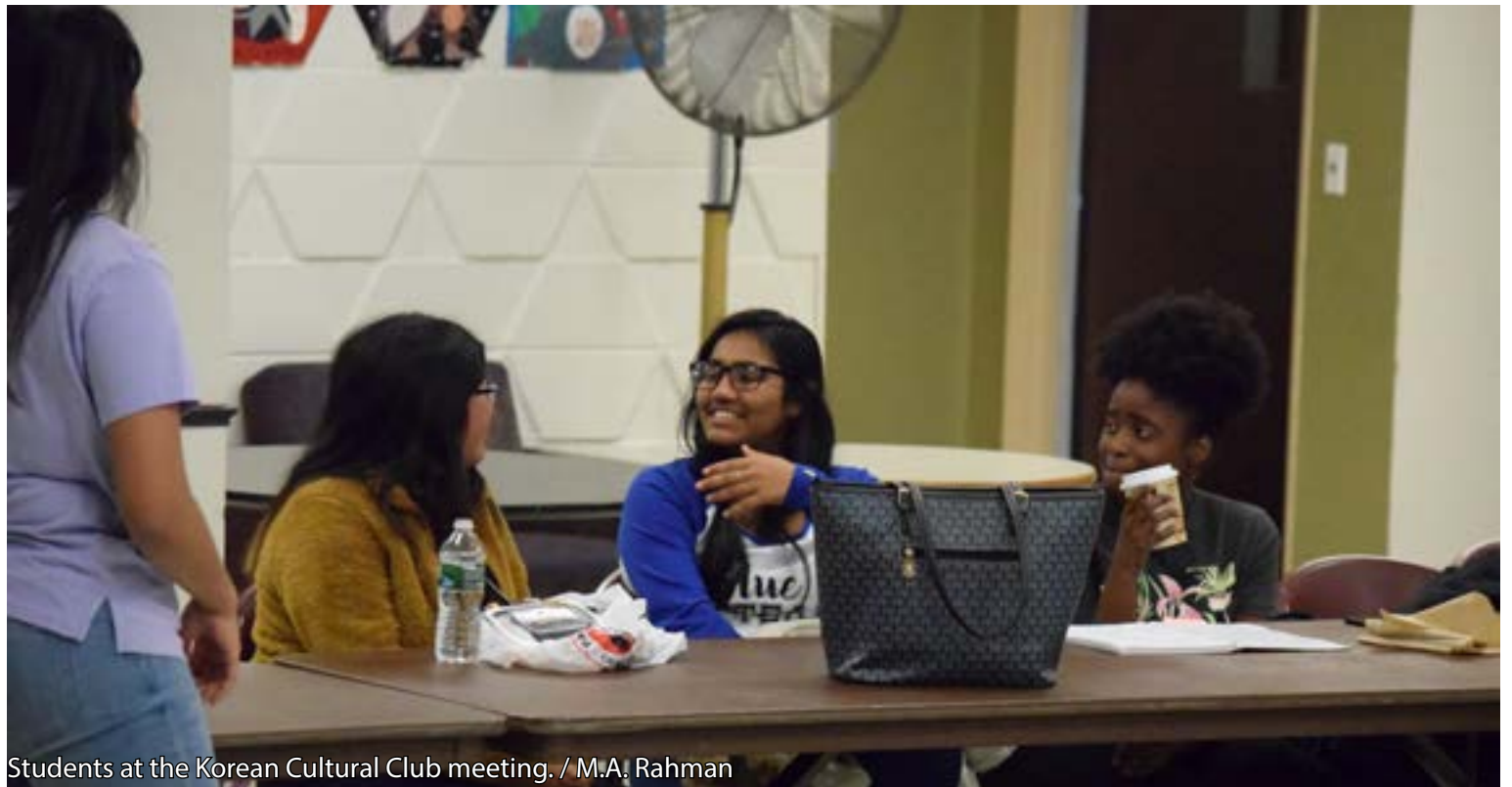
Students at the Korean Cultural Club meeting.

the ground,” one student shared, “because if you do, we were told a bad spirit would follow you.”