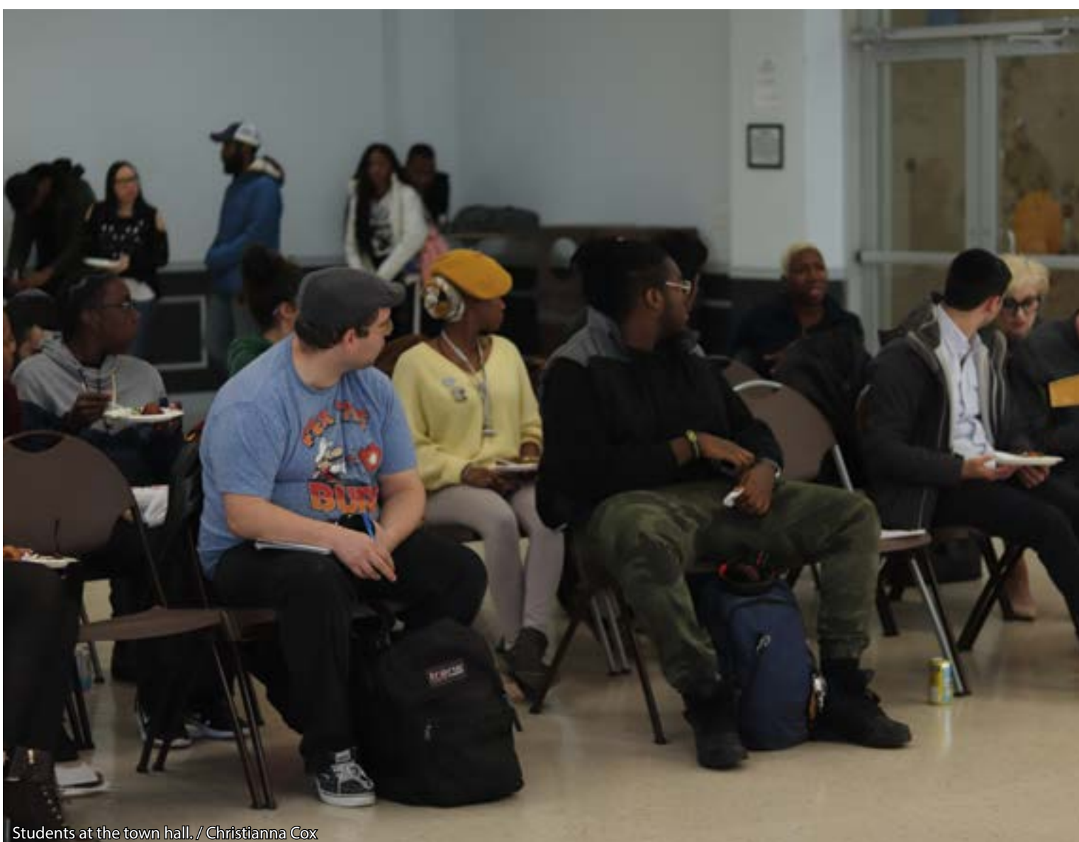
Students at the town hall.

While nothing was resolved in the town halls, just by having them USG has signalled that they are intent on finding avenues to address student concerns.