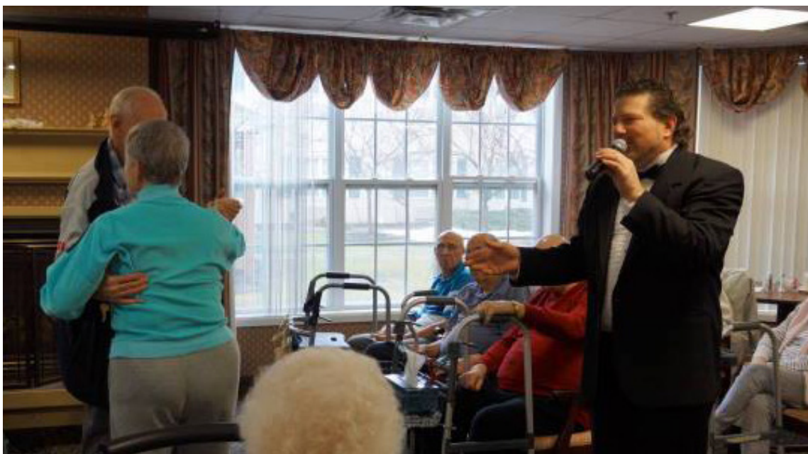
Bender serenading an elderly couple.

Perhaps, as David Bowie said, we can be heroes just for one day.