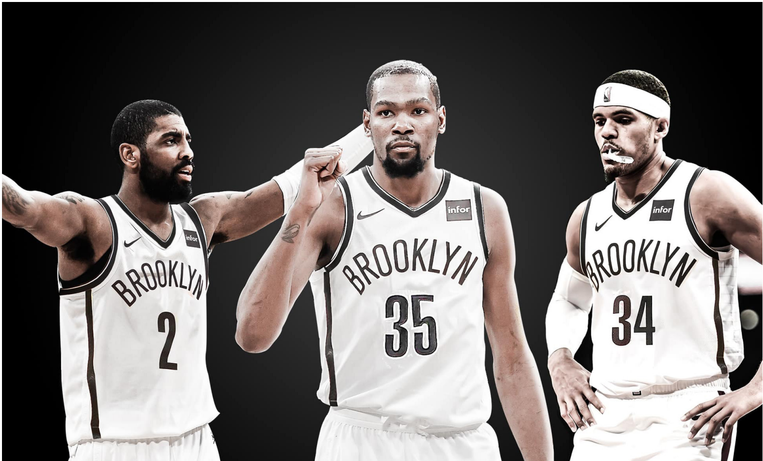
Brooklyn Nets Players.

When the NBA season was suspended on Mar. 11, 2020, the Brooklyn Nets were in a rather precarious position, and it seems that as the league restarts, their situation hasn't become much better. The team was in the 7th spot in the Eastern Conference, set to go up against one of the best teams in the league if the playoffs started that day. During hiatus, there was growing optimism among Nets fans that both Kevin Durant and Kyrie Irving could return if and once the season resumed.