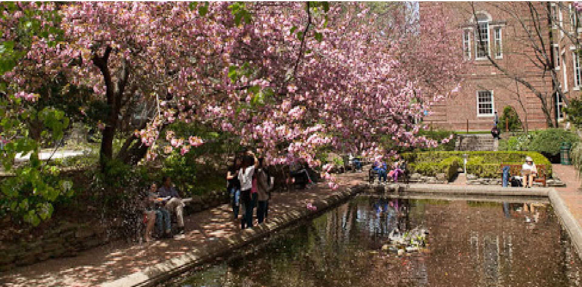
BC's Lily Pond, which many students will have to wait to see again.