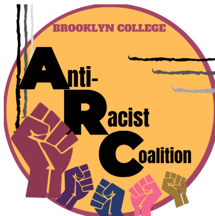
Brooklyn College's Anti-Racist Coalition Logo

The same day, a newly formed group called the Anti-Racist Coalition at Brooklyn College organized to discuss the same issues. The Coalition is comprised of many of the BC students, faculty, and staff who wrote