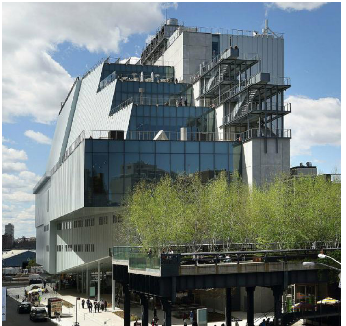
Whitney Museum will reopen September 3rd.

"Devastating racism and inequity are all too prevalent across the United States," they wrote in a statement. "As a museum of American art, we have sought to make visible and condemn, through the voices of the artists and art we present, the injustice, systemic