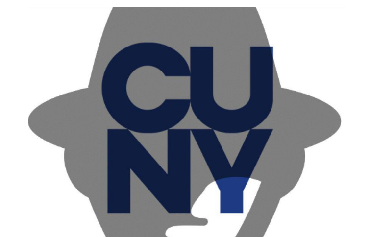
Students worry new testing programs may infringe on privacy./ Edited by Humza Ahmad

and violate their rights to privacy," the petition says. "Proctorio is a direct and abhorrent violation of privacy at every conceivable level...Full and unrestricted access to personal data from students (computers, private physical rooms, and other means of identification/monitoring) is a despicable overreach by CUNY, and McGraw Hill. It is unacceptable that students must surrender their civil rights, especially while attending a public institution, to complete their education." Students hope that all CUNY schools will involve student leaders in the search for alternatives to online proctoring and to notify the students that they are not required to accept the terms and conditions of any online proctoring software. "The data privacy, student