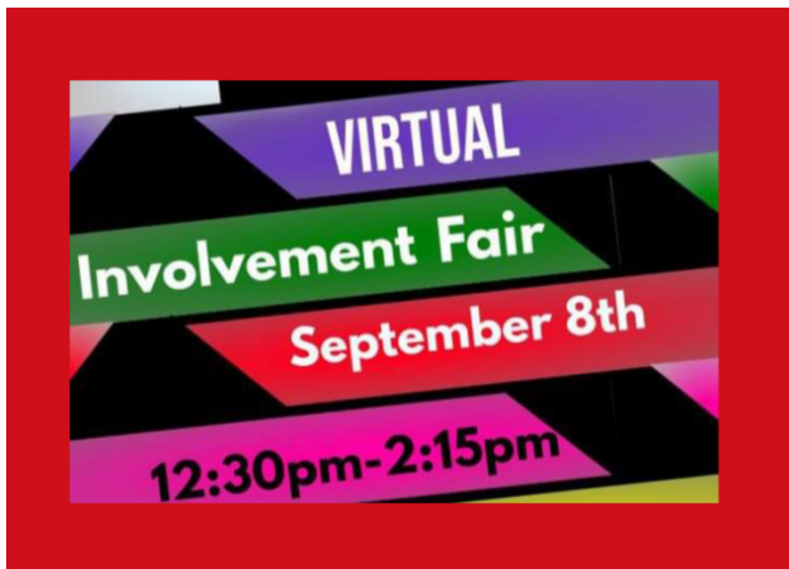
Poster for SAIL'S "Virtual Involvement Fair."

Now online, one of the significant components in MGB's fair preparation was the promotion of their Zoom meeting room. To better their expected turnout, MGB board members collaborated with the college's Islamic Society, Muslim Women's Educational Initiative, and other club board executives. Together