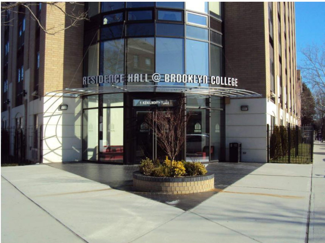
Residence Hall at Brooklyn College has stopped operating by the end of July.

For many, the residence hall’s quiet shutdown seems to deny its infamous reputation. Known across Brooklyn College’s campus for dirty conditions, floods, and a hostile environment, RHBC has attracted unwelcome attention for years. In May 2019, both the Kingsman and Excelsior newspapers reported on grimy conditions and reports of sexual harassment by employees at the dorms. The articles followed YouTube videos and a short film about the residence hall released by BC film student