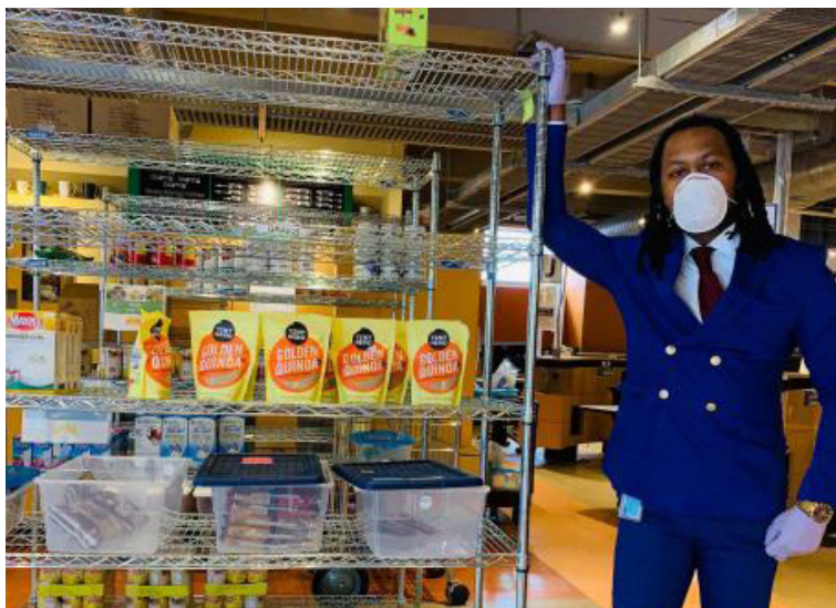
The Food Pantry at Brooklyn College, which is funded by Student Activity Fees.