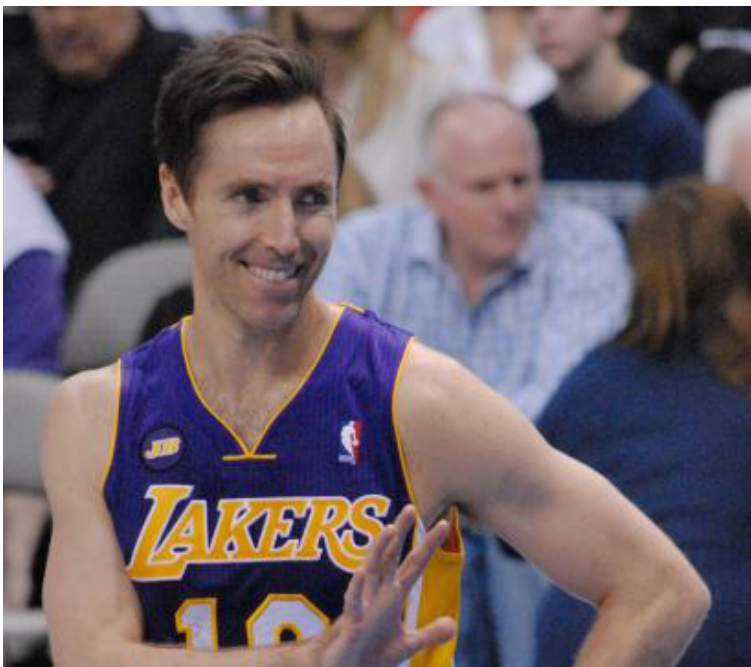
Steve Nash playing in 2013.

Because superstars run the NBA, and in many senses, they always have. Marks needed a coach that, the moment he steps into the building everyday, commands the respect of his star duo, especially concerning the enigmatic nature of Irving and to a lesser extent, Durant. On sharpshooter (I'm sensing a trend here) J.J. Reddick's "The Old Man and the Three" podcast last week, Durant commented on the Nash hire. "Every time I'm in the gym with him, I was always like a sponge," said Durant. "I'm looking forward to this man. I always feel like I'm a student of the game. Somebody who has experienced so much and played in different eras, I'm looking forward to him teaching me some more things about it as well." Sean Marks made a high profile pick with the Nash hire to a four-year deal. It's not the mecca of New York, but Brooklyn isn't Indiana. Expectations will be sky