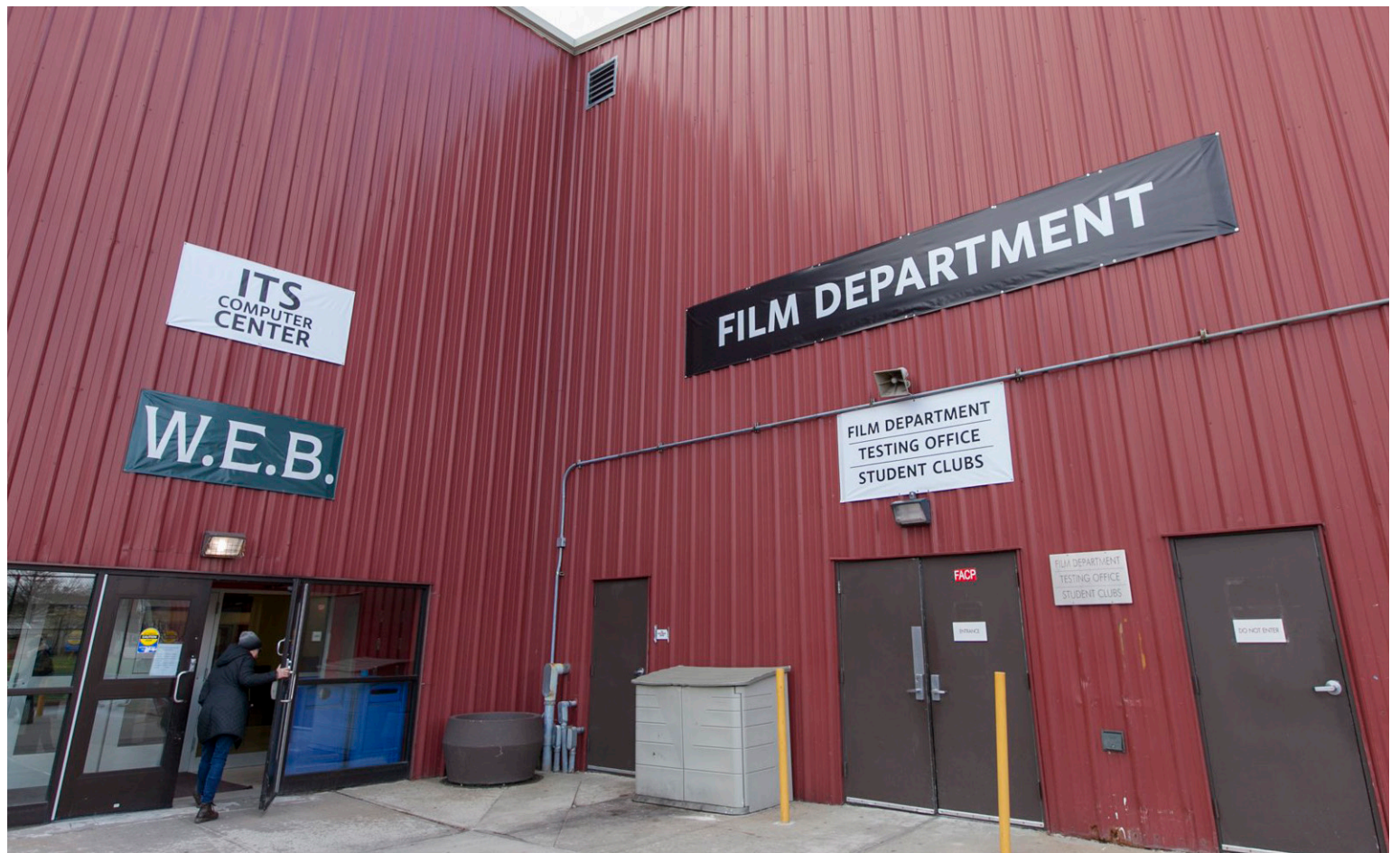
Brooklyn College WEB building.

“The Reentry Review Board is very thorough in its assessment of campus usage plans and often sends a department’s plans back