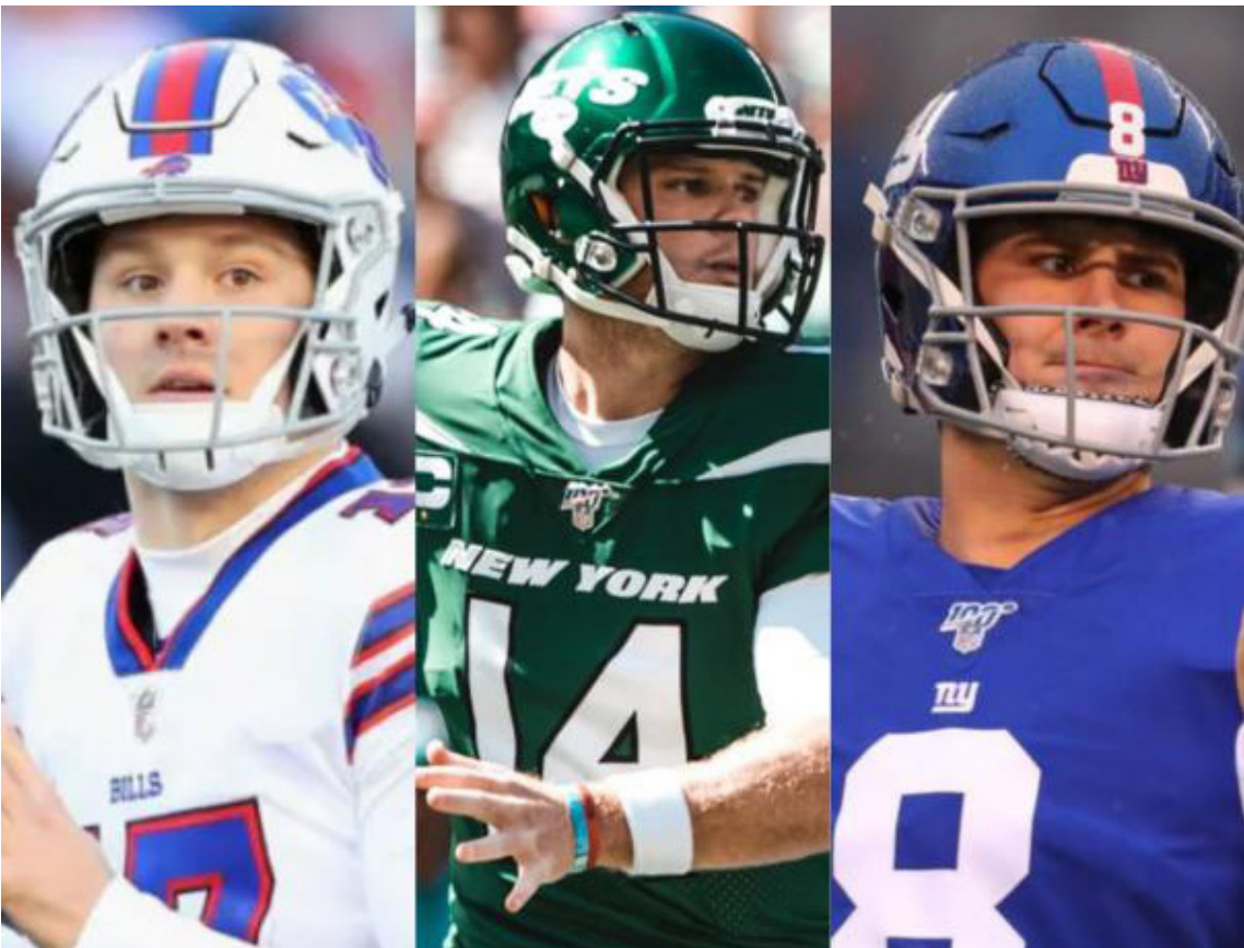
(Left to right) Josh Allen, Sam Darnold, Daniel Jones.

been defense, and the Bills defense has been one of the best in the league. With players like Tre'Davious White and Micah Hyde in the secondary, it is hard for any team to complete passes. With Tom Brady leaving the New England Patriots, this seems to have made the division a little more open. This could be the perfect opportunity for the Bills to get their first division title since 1995. The Jets had hope in the offseason, similar to the Bills, to fill the power vacuum, but that dream quickly faded. The Jets started week one against the Bills and pretty much looked hopeless in the first half. Their defense could not do anything, and Sam Darnold struggled having a 19.3 QBR. Jamison Crowder seemed to be the only offensive weapon the Jets had, which isn't a good thing. Le'Veon Bell picked up an injury that looks like he might be out a few weeks, which now puts timelord, Frank Gore, as the lead back, which makes things worse on offense. The defense looked terrible, and you can tell that trading away Jamal Adams was a mistake. He pretty much was the defense last season, and with him not there, the Jets' defensive issues were compounded. Along with that, C.J. Mosley choosing to sit out (which makes perfect sense) is the